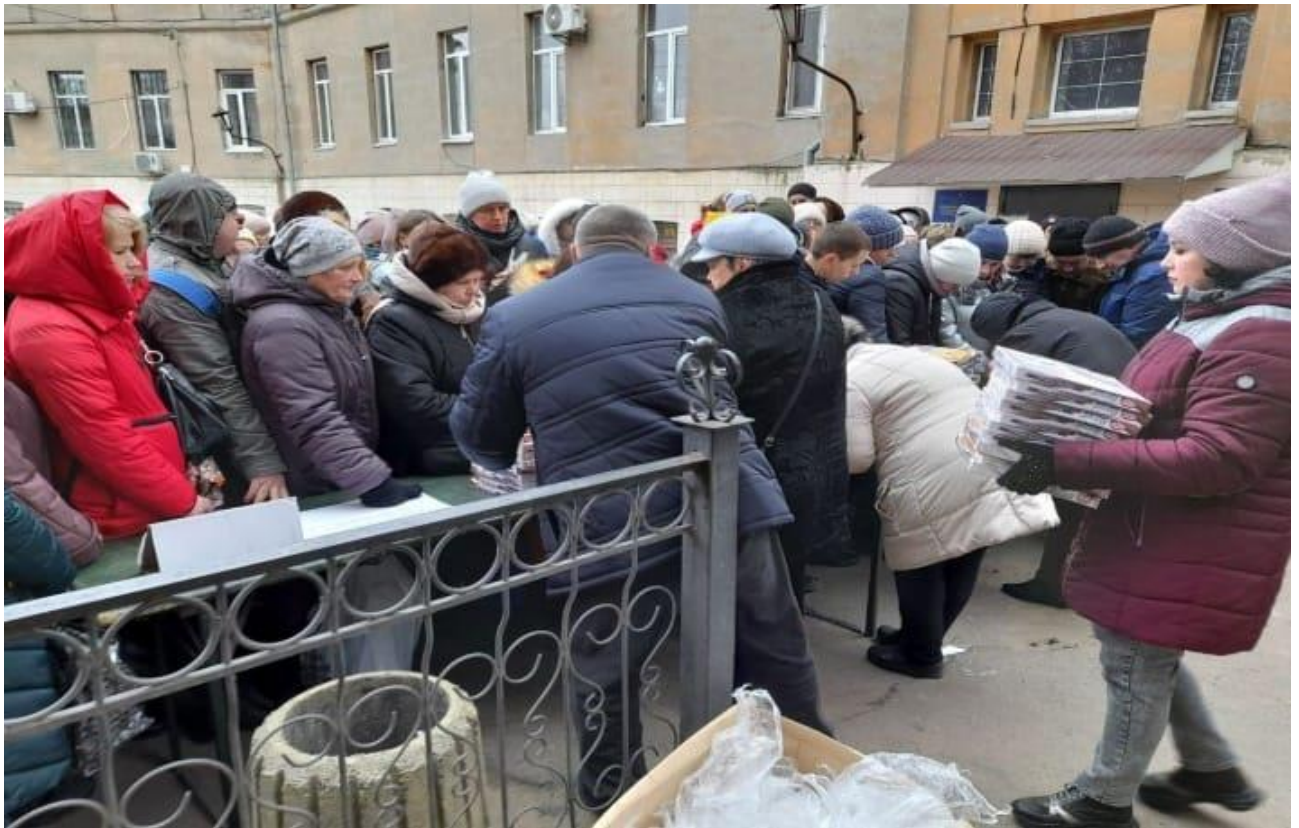
Aid to internally displaced persons