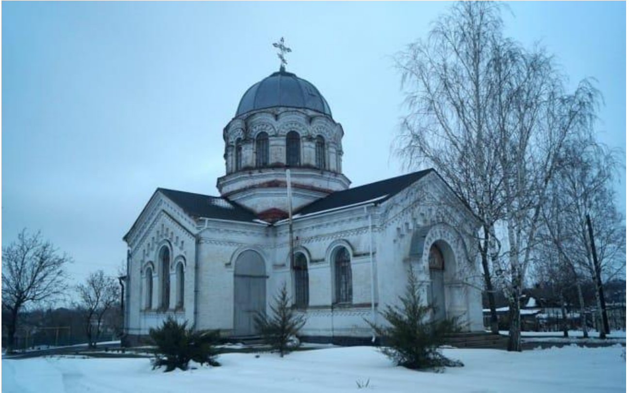
Temples in the community