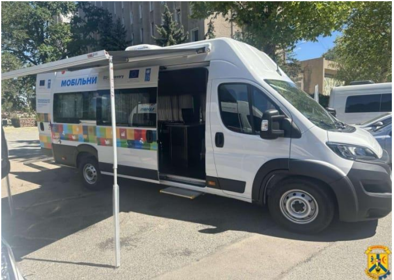
Mobile Administrative Services Center