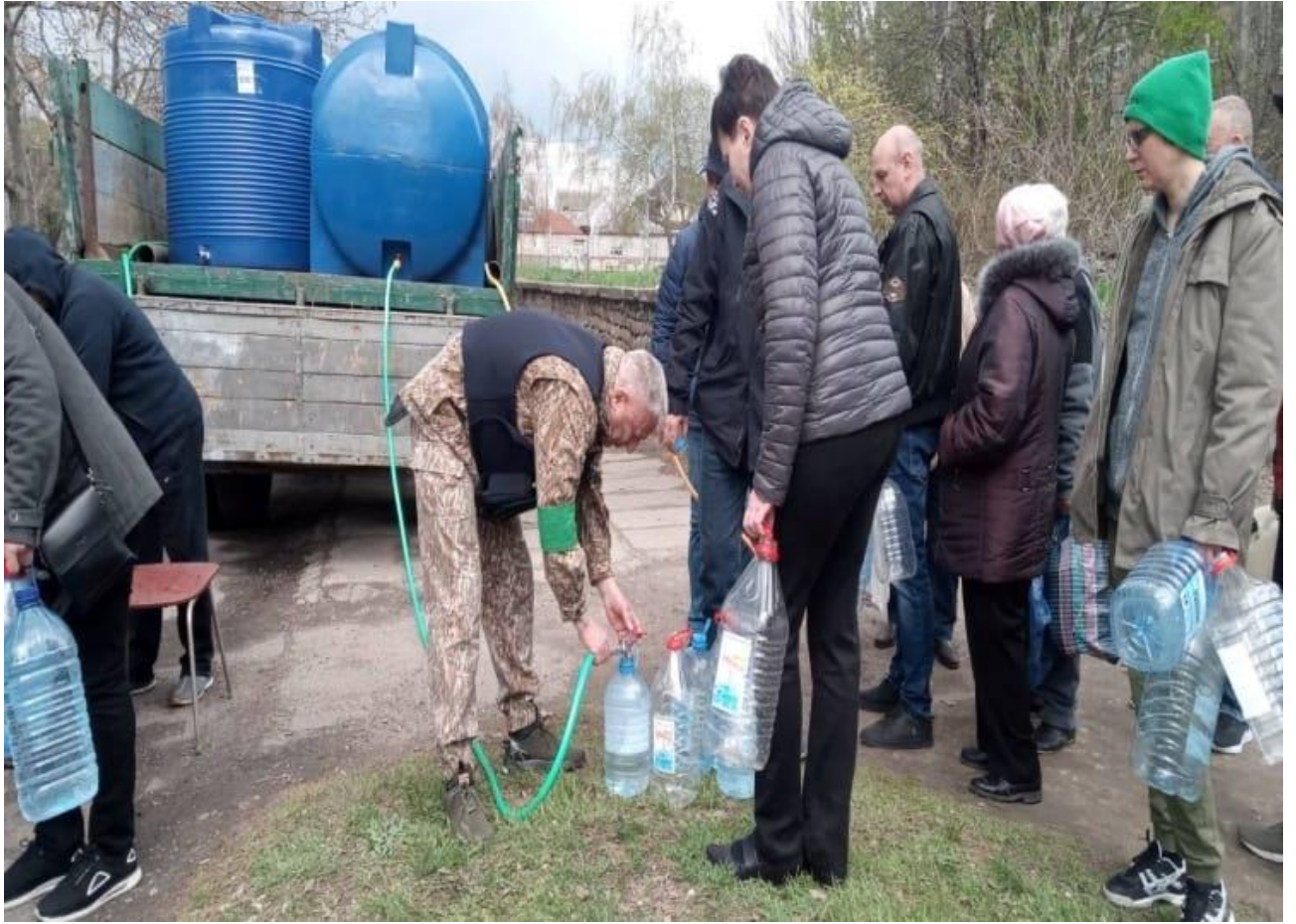
Aid to residents of destroyed population centers