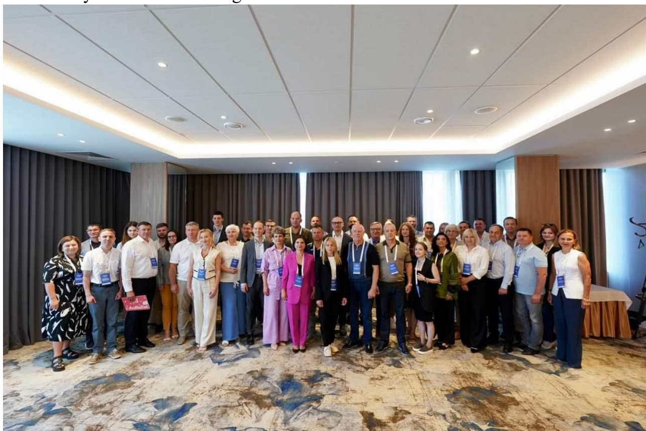
Signing of a trilateral Memorandum of Understanding between GIZ, the public