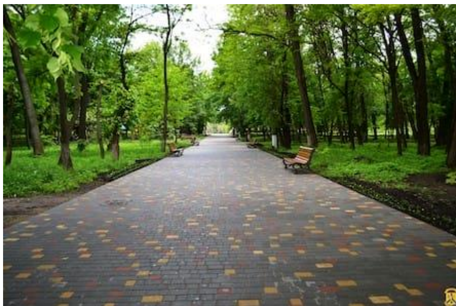
Town Park of Culture and Recreation "Friendship of Peoples"

Health care services for community residents are provided by 3 communal non-profit enterprises.