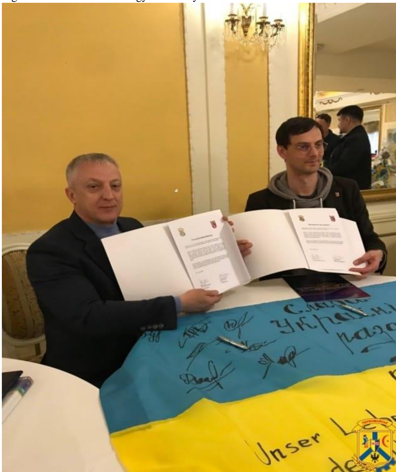
Declaration of friendship with the Berlin district of Neukölln

organization "School of Energy Efficiency" and the Pervomaisk Town Council