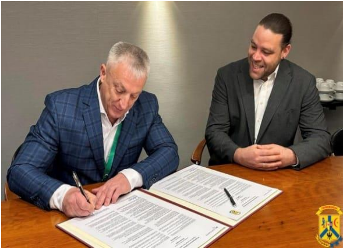
Signing of a project partnership agreement with the town of Augsburg (Germany)

During the trip to the town of Augsburg, an exchange of experience in the field of water supply took place and the peculiarities of water supply network management and German water supply systems were studied. The German town of Augsburg provided assistance to the utility companies of Pervomaisk in the form of trucks and technical equipment.