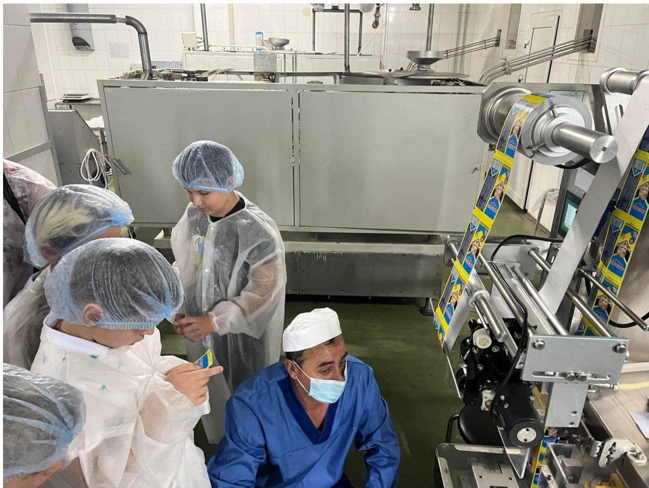
A tour for children to the Pervomaisky Milk Canning Plant

The Pervomaisk Milk Canning Plant is Ukraine's leading company in the production of condensed milk. It is one of the few Ukrainian enterprises that has not suspended its production for a day since the full-scale invasion. The plant provides support and assistance to the military and Ukrainians affected by the war.