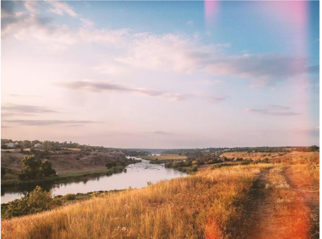
Mounds in the community

In one of the community's villages, a railway junction was established in 1899.