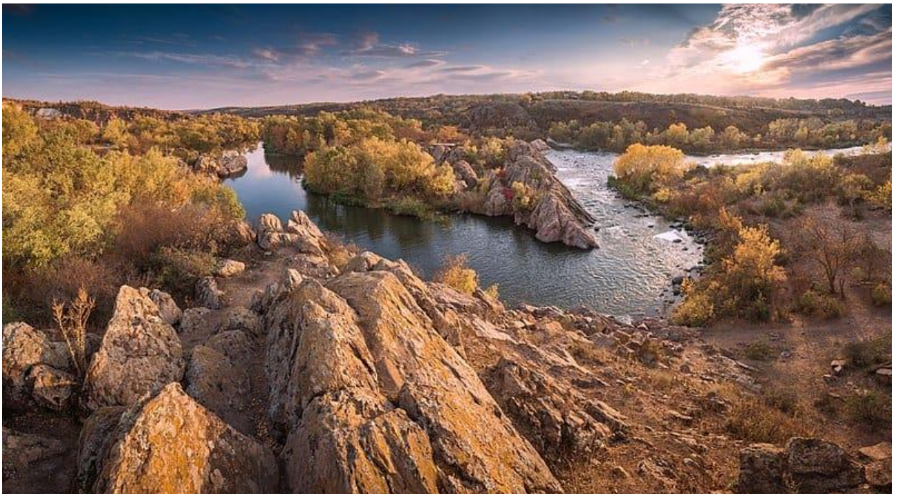
National Nature Park "Buzkyi Gard" Source

The National Nature Park "Buzkyi Gard" is one of Ukraine's seven wonders with a unique landscape of the Buh rapids and inimitable flora and fauna. It is a real find for athletes and tourists from all over Ukraine who are introducing an active and healthy lifestyle. The Park is located in the territory of Pervomaisk district and spans the area of 6,138.13 hectares.