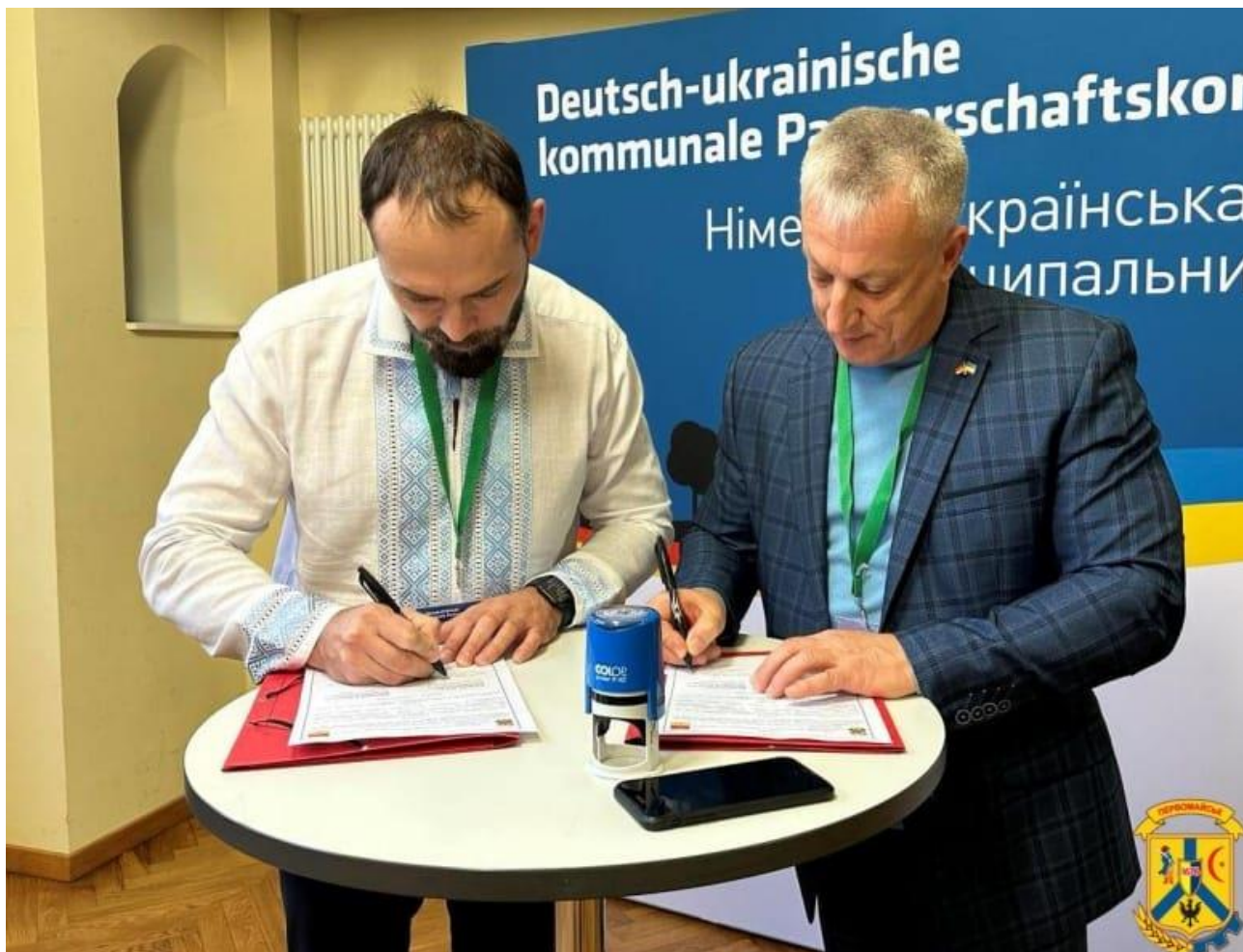
Signing of the Partnership Agreement with the Pervomaiskyi Urban Territorial Community of the Kharkiv Region